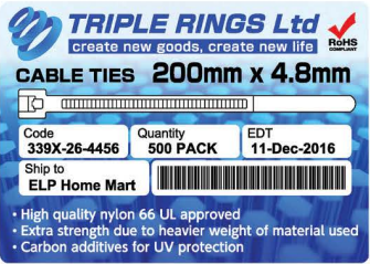
Epson pigment ink

The ColorWorks C6000 series incorporates UltraChrome DL pigment inks that comply with BS 5609 certification for GHS compliant labelling. These inks possess high pigment density, resin coating for more stability, and an even surface and gloss, making it perfect for professional display and sales.