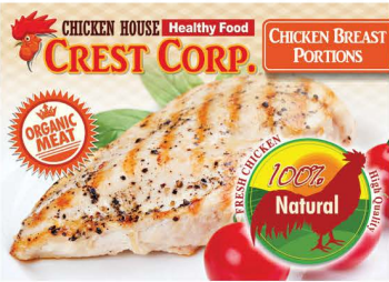
Food and beverage label