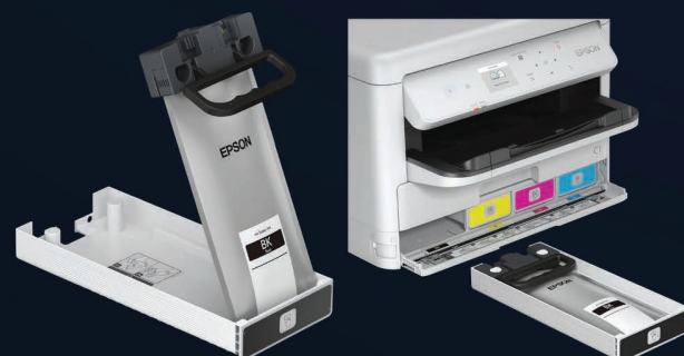
Designed for easy replacement of ink packs